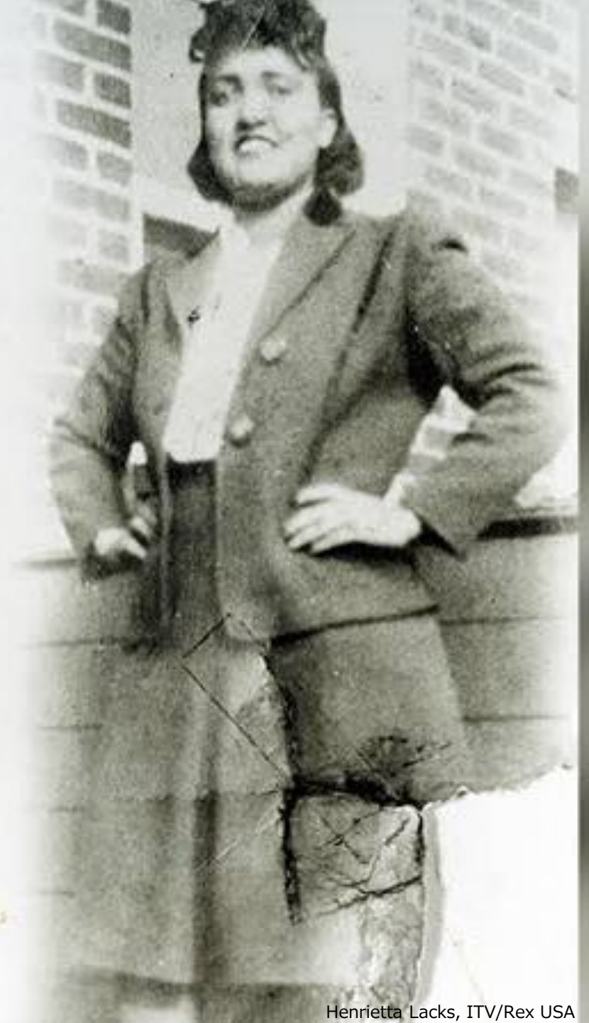
Henrietta Lacks

Further proved the importance of informed consent and patient understanding of studies